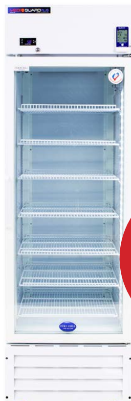
Medi Guard® 401 Fridge