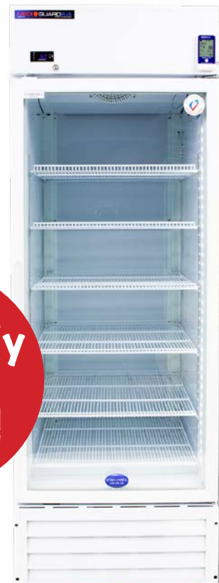
Medi Guard® 601 Fridge